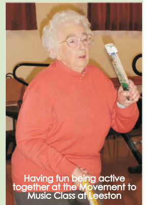
Having fun being active together at the Movement to Music Class at Leeston