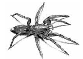
Actual size of an adult female white-tailed spider