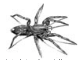
Actual size of an adult female white-tailed spider