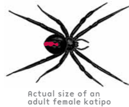
Actual size of an adult female katipo