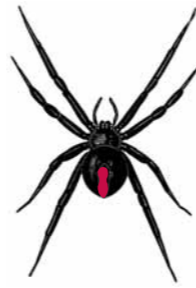
Actual size of an adult female redback