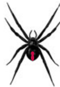
Actual size of an adult female redback