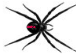
Actual size of an adult female katipo